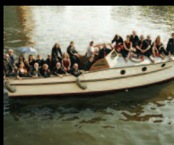
Akademie für Alte Musik Berlin