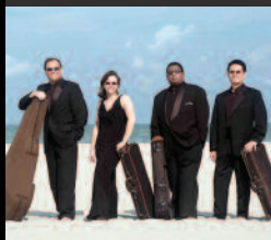
Miami String Quartet