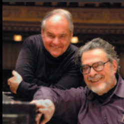
Jaime Laredo and Leon Fleisher